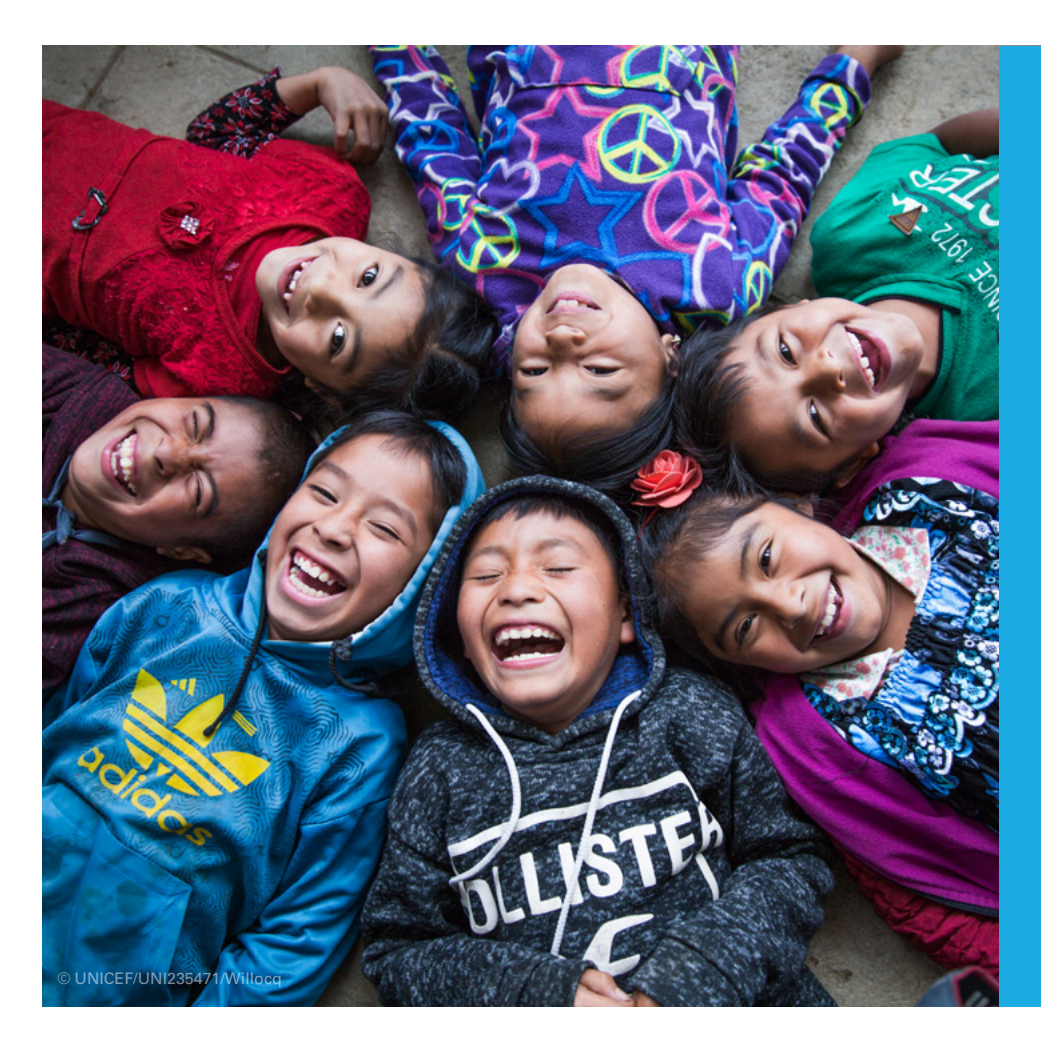
Children of the indigenous community of Chicoy of Todos Santos Cuchumatánin in the province of Huehuetenango, Guatemala on October 16, 2019 enjoy their last day of school.