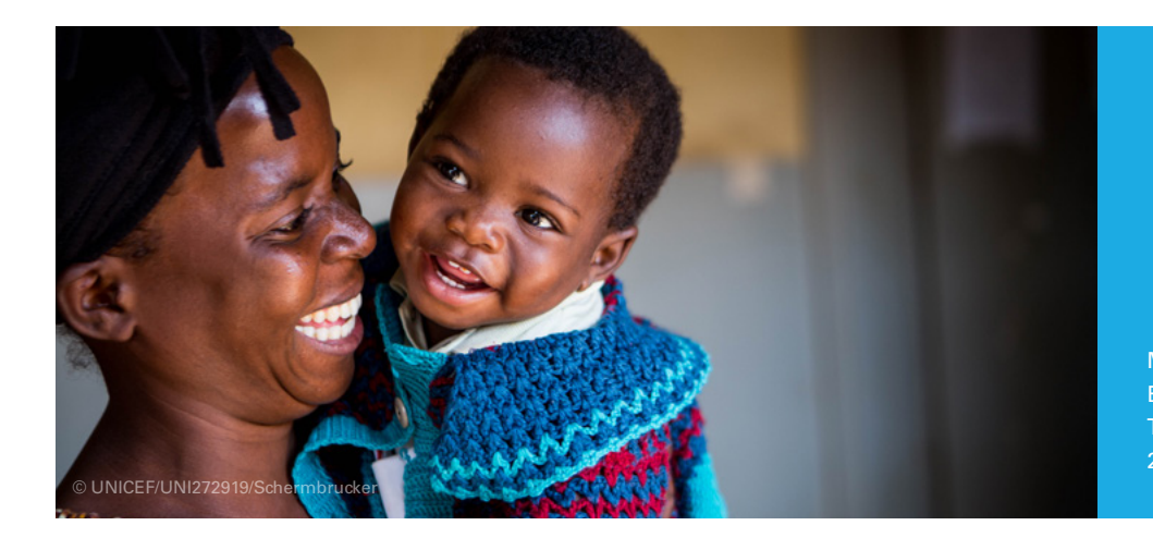
Mother and child at the Bvumbe Health Centre, Thyolo Blantyre Malawi 21 April 2017.